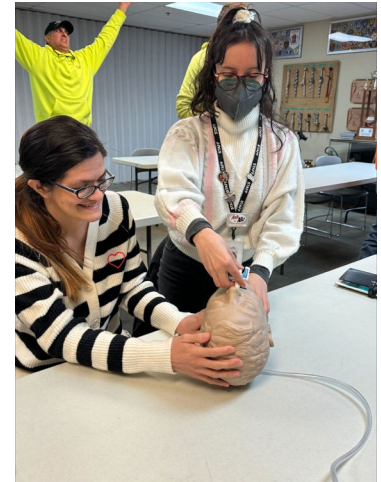
Library staff practicing administering Narcan after taking the training.