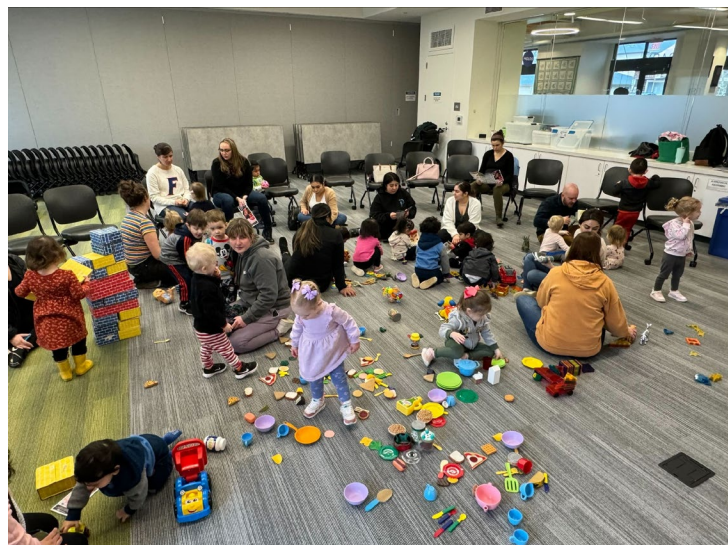
Movers and Shakers story time stay and play participants.