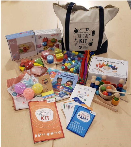
Sample contents of STEAM Curiosity Kits from United Way of the Columbia-Willamette and Early Learning Washington County.