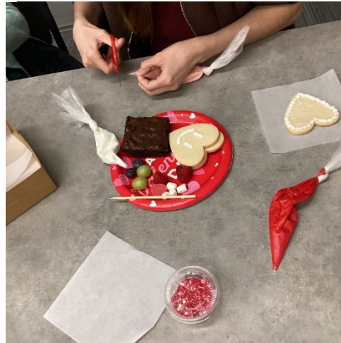
Sample sweets adults decorated for the February adult program.