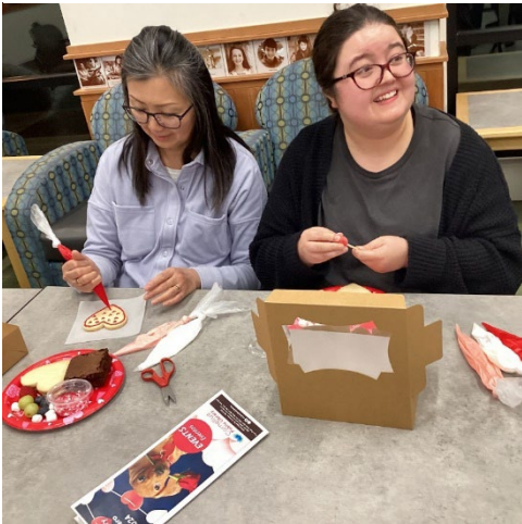
Adults participating in the February program!