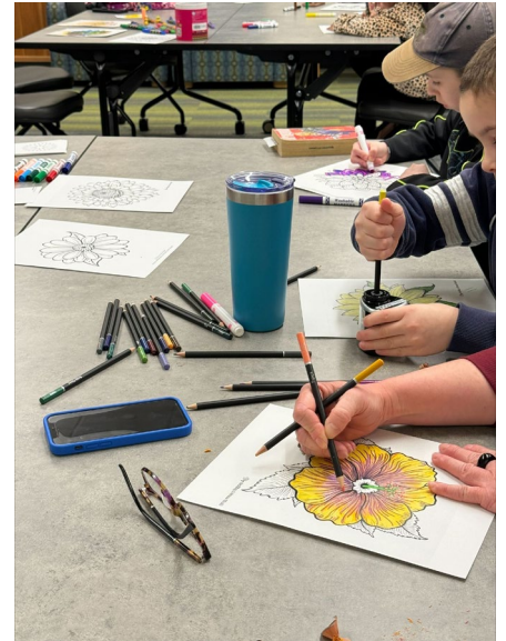
Families coloring flower for the spring wings display in March.