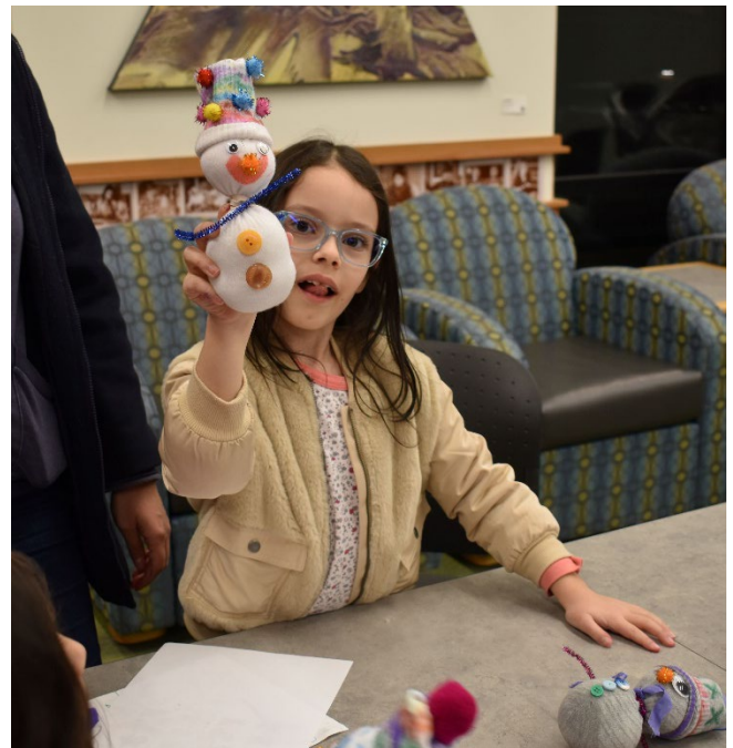
Happy child showing off her Sock Snowman!