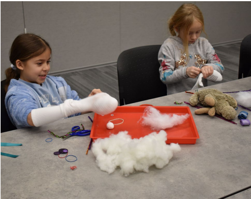
Children work on their Sock Snowman!