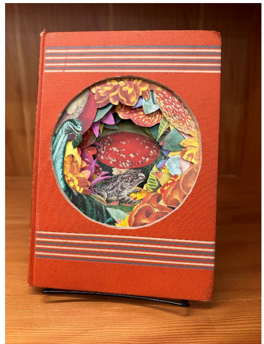
Tintary collage art book on display