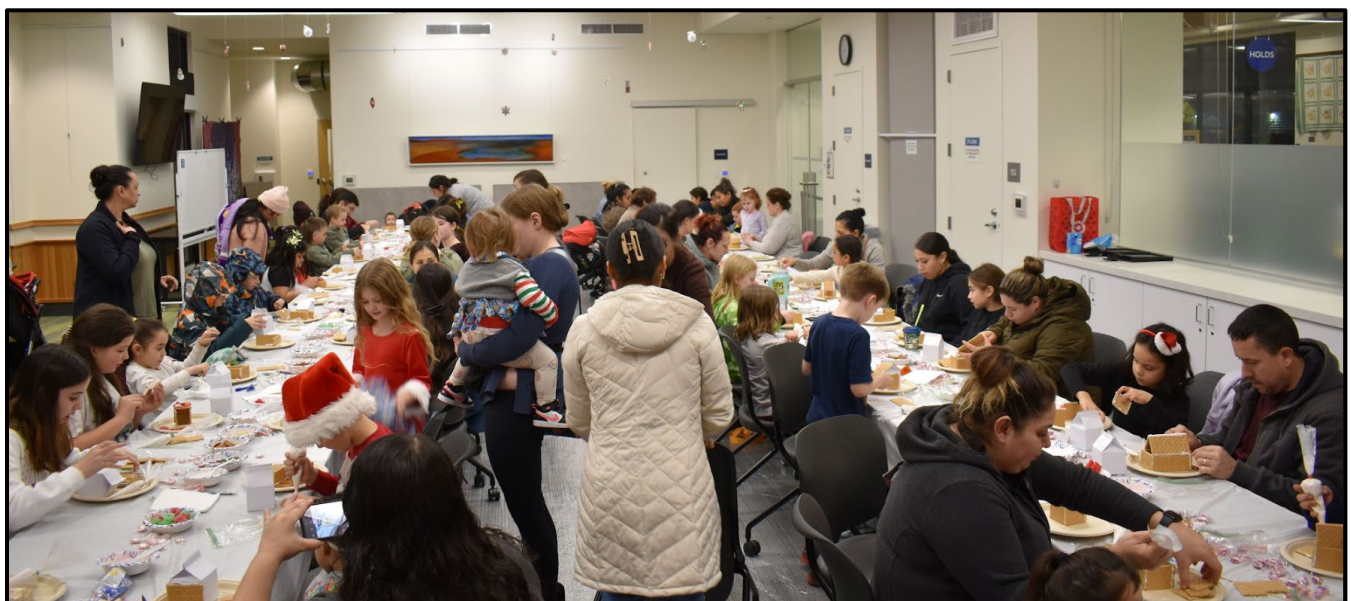
Over 150 people participated in the gingerbread house making