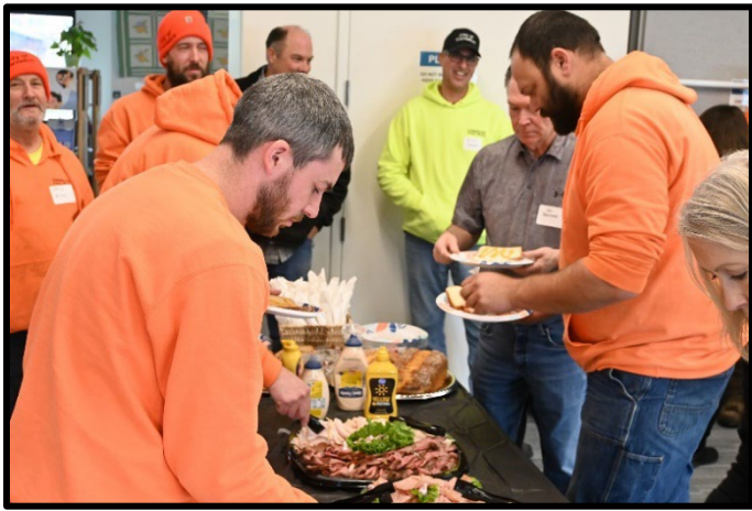
Celebrating City staff with a lunch and games