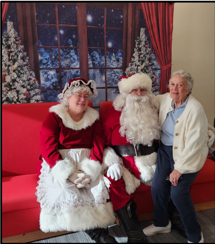
Mr. & Mrs. Claus visit the library