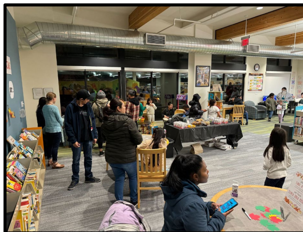
Art reception with Cornelius Elementary