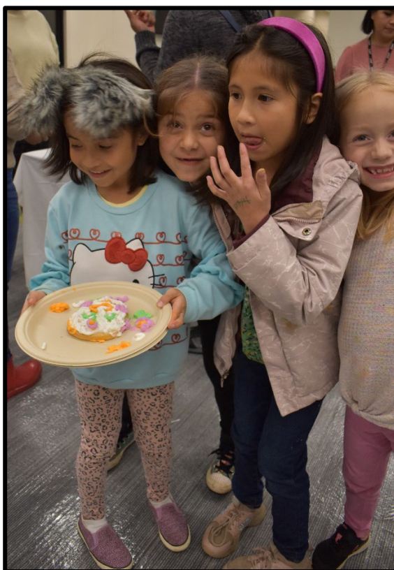
Day of the Dead cookie decorating