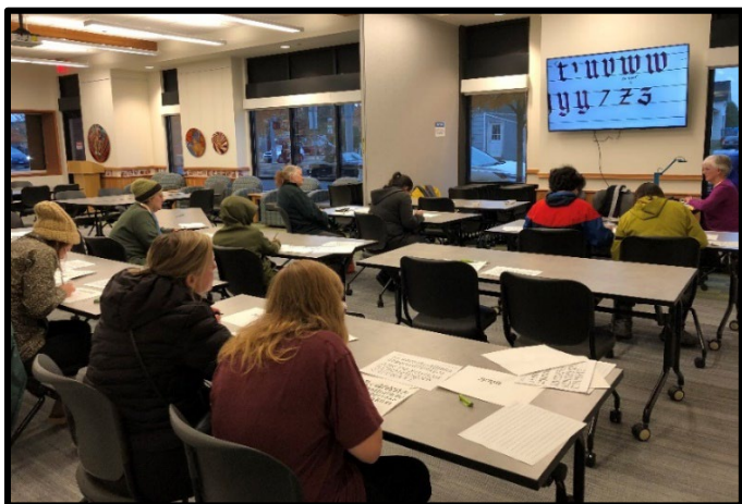
Calligraphy program for teens and adults