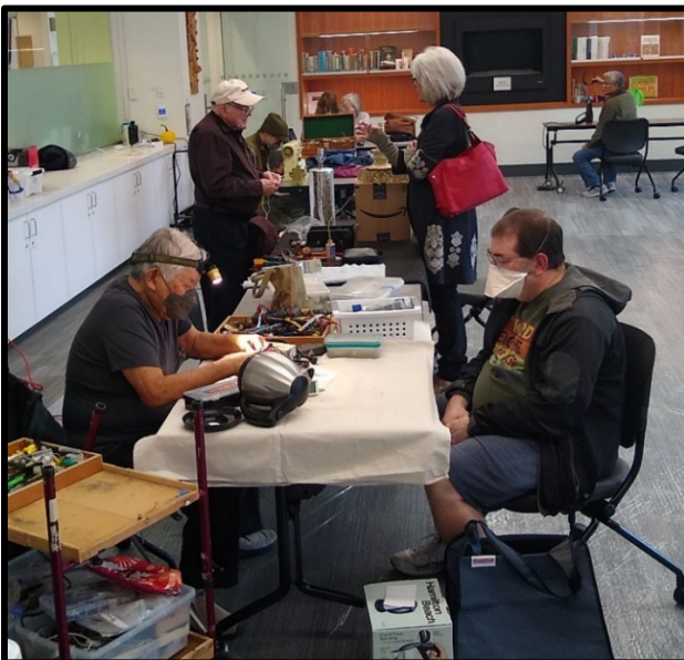
Repair Fair participants