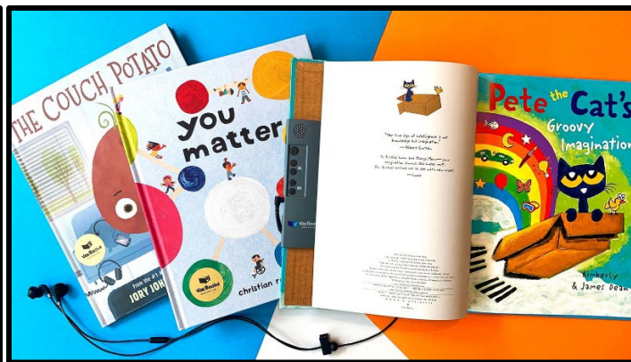
Example of children's VOX books, similar to an audiobook