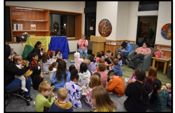
PJ Storytime with milk and cookies provided by the Friends of the Library