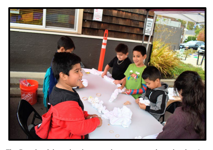
The Cornelius Library booth was teaching visitors to do tie dye shirts!