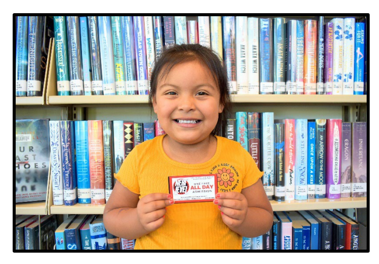
Summer Reading Kids Winner