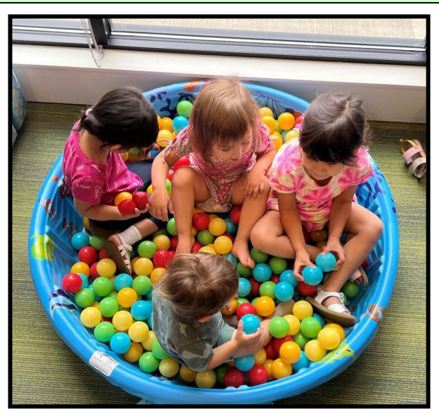
Toddler Fun Program