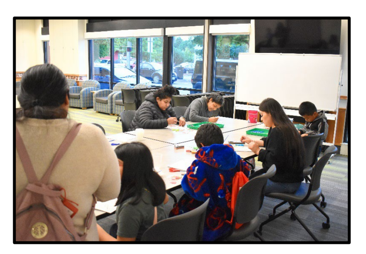
Hispanic Heritage Event: Decoupage Portraits | Mosaicos de Personajes