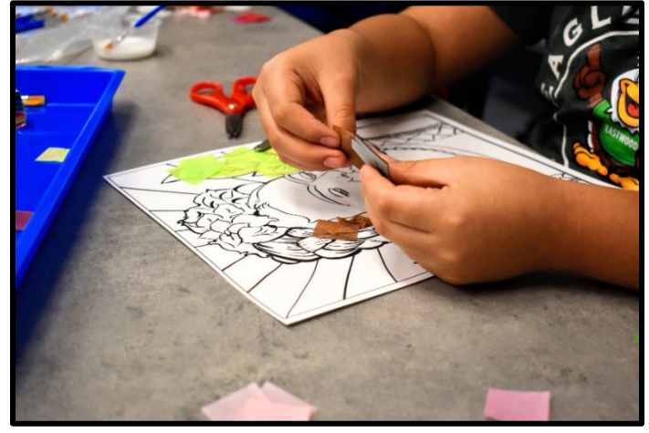
Hispanic Heritage Event: Decoupage Portraits | Mosaicos de Personajes