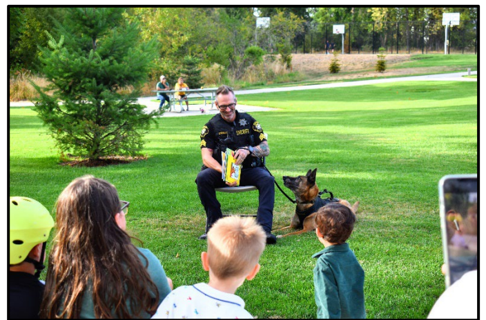
Sergeant and K-9 Storytime