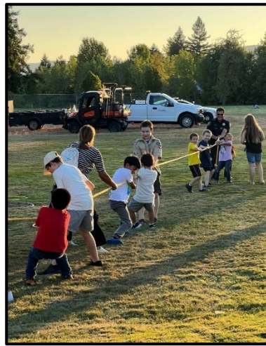
National Night Out