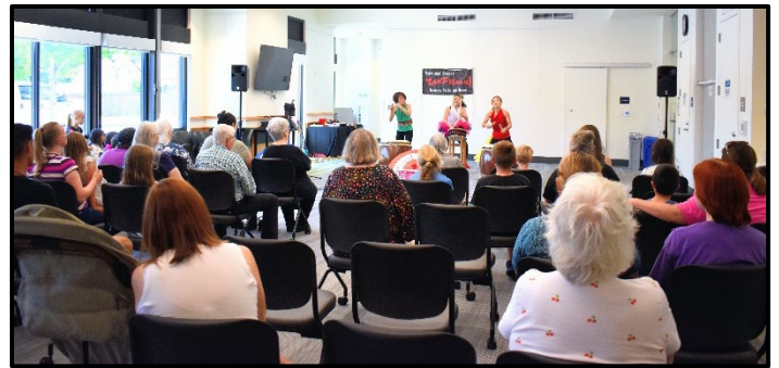
Family Program: Takohachi- Japanese Drum & Dance Performance