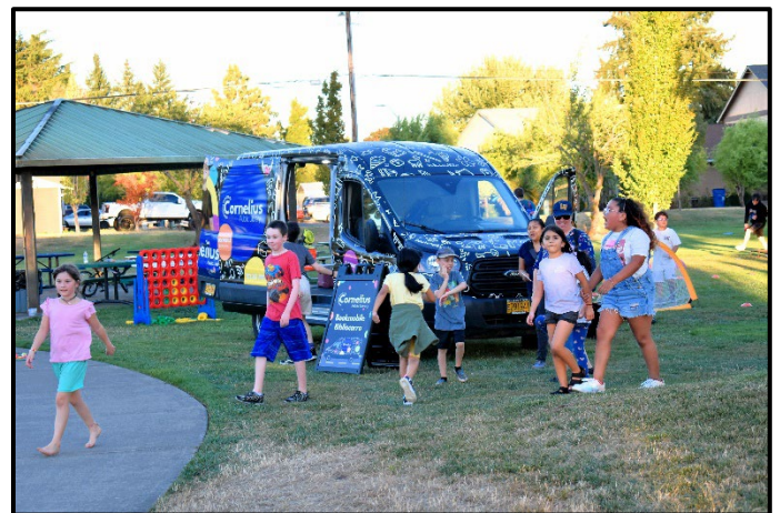
Bookmobile at the Park Event