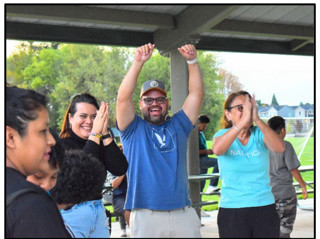
Happy residents at the Bookmobile at the Park Event