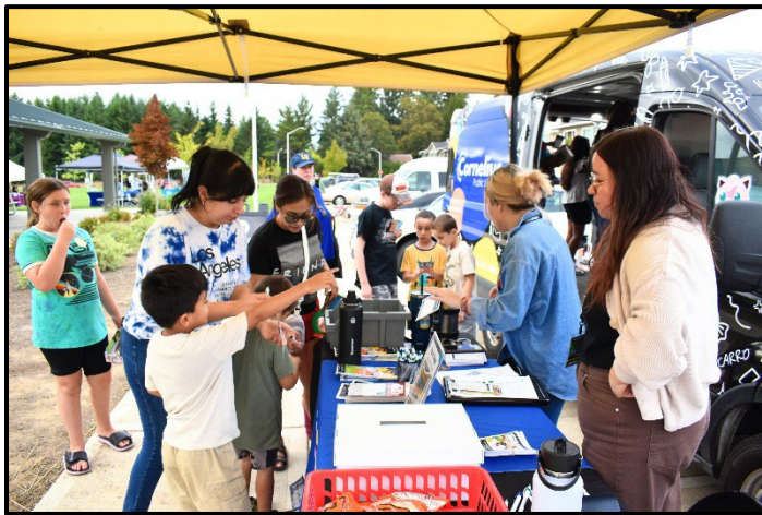
Library volunteers help distribute library information to community members.