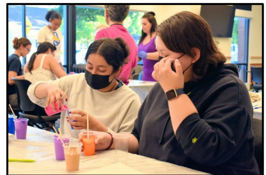
Adult Arts and Crafts Program