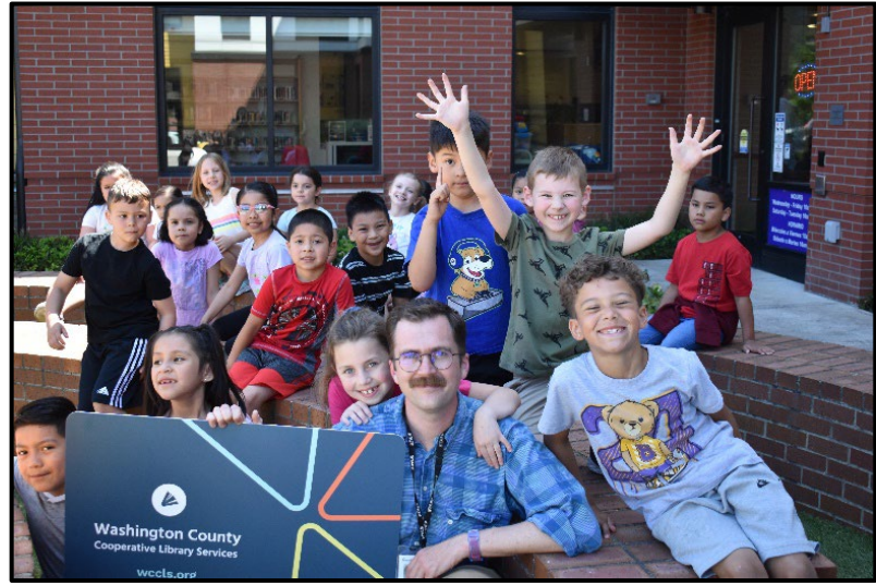
Students visit the library