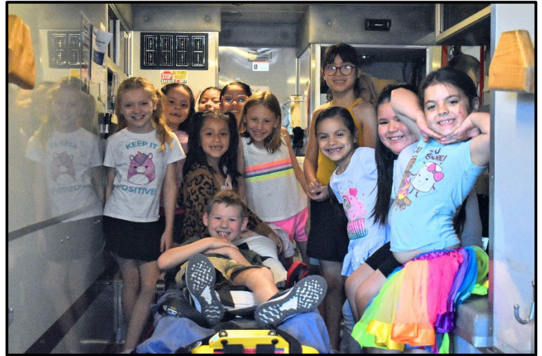
Students inside a firefighter truck after touring the library