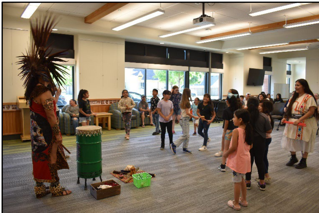
Cornelius Elementary Aztec Dance Group performing for the Friday Family Fun program