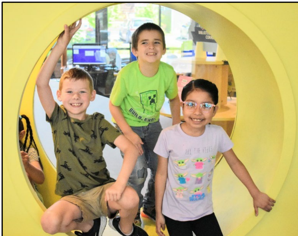
Little patrons enjoying the library