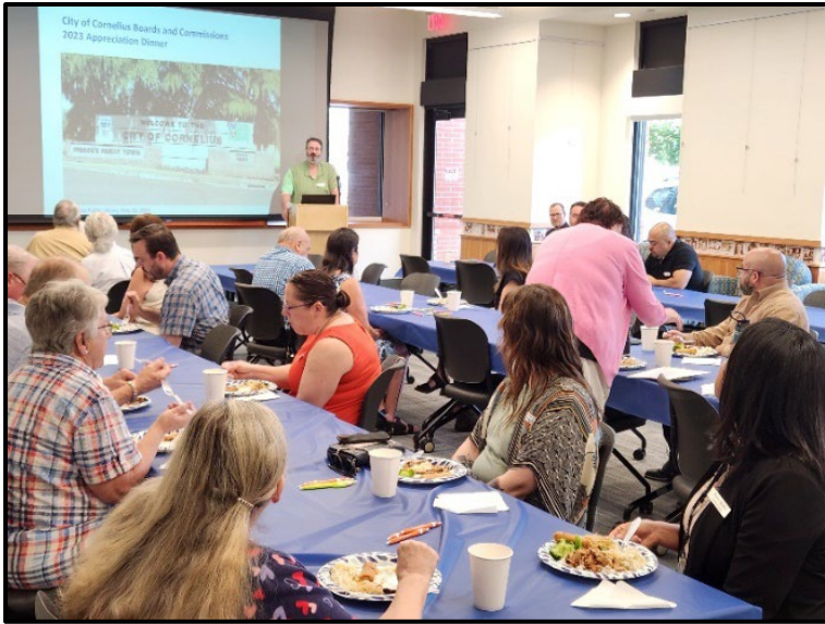
City Council, Board and Committees Appreciation Dinner