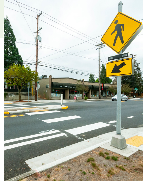
Above: Example of a completed Rectangular Rapid Flashing Beacon (RRFB) crosswalk, creating a safer and more visible pedestrian crossing along a busy corridor.

PROJECT WEBSITE: tinyurl.com/CorneliusRRFB